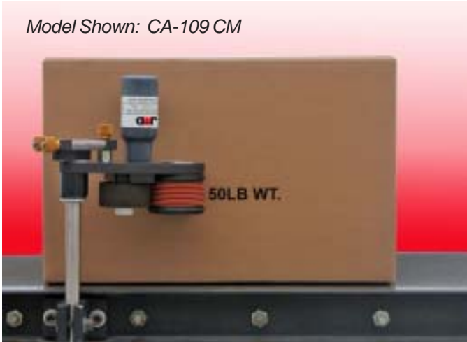
Model Shown: CA-109 CM

JMD's Mini-Coders are recommended for applications which require printing a small amount of code data on cartons or other flat surface materials. The unique inverted design enables the continuous Mini-Coder to print within 1/2" of the conveyor belt (within 1-1/8" of the conveyor belt with reset models). Our patented dual compression spring tension mechanism allows the unit to be installed on either side of the conveyor line without modification.