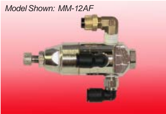
Model Shown: MM-12AF